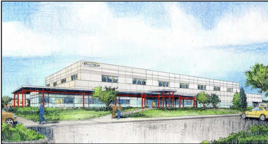
Pacific Cheese Processing Facility Amarillo, Texas