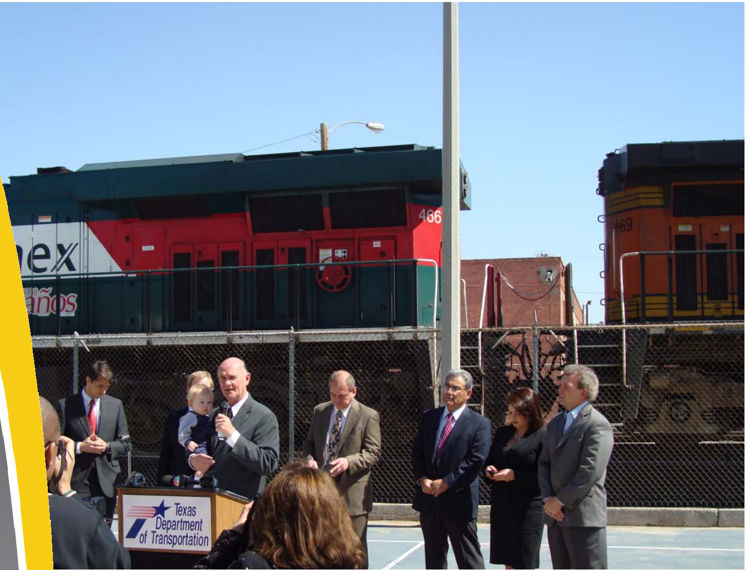
The groundbreaking ceremony for the removal of the at-grade rail-to-rail crossing located in the Chihuahueta Neighborhood - Thursday, March 4, 2010